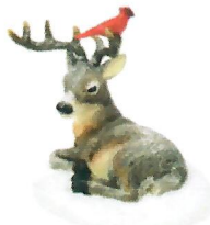
"Cardinal Christmas Deer"