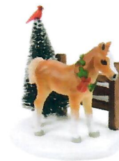
"Cardinal Christmas Pony"