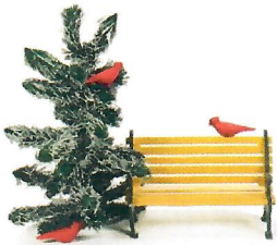
"Cardinal Christmas Bench"