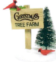
"Cardinal Christmas Sign"