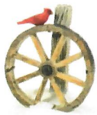
"Cardinal Christmas Wagon Wheel"