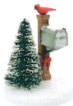
"Cardinal Christmas Mailbox"