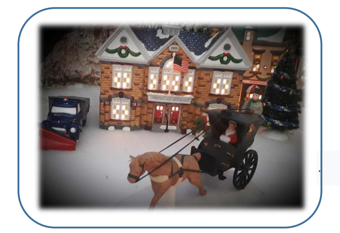
Christmas Village 2023 By Peppe Apuleo