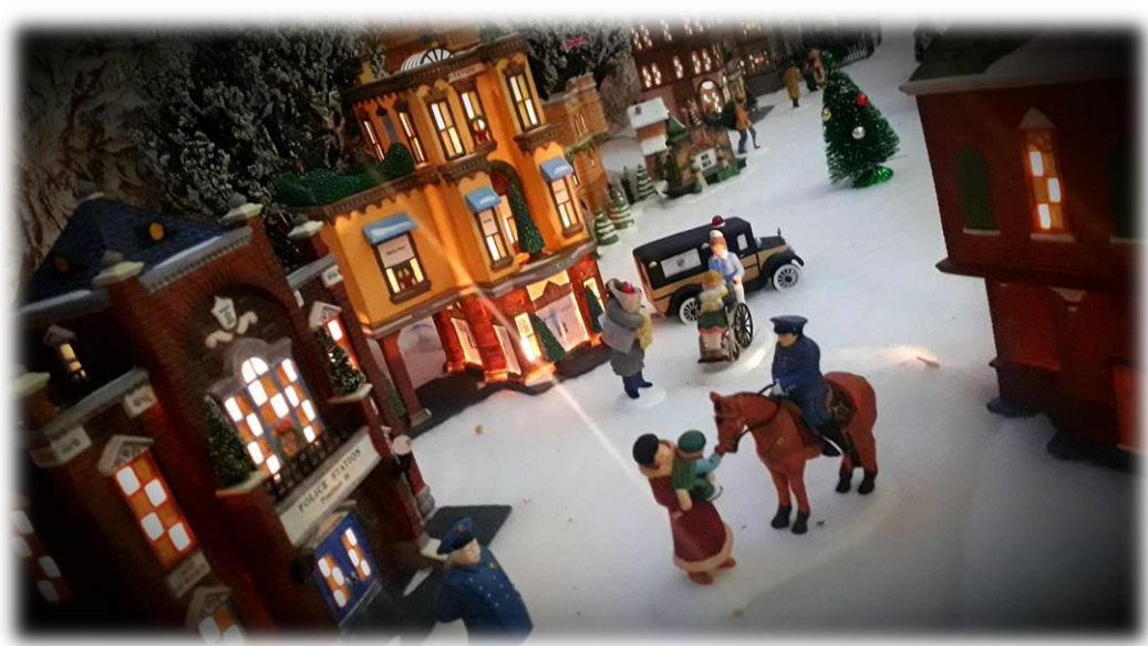
Christmas Village 2023 By Peppe Apuleo