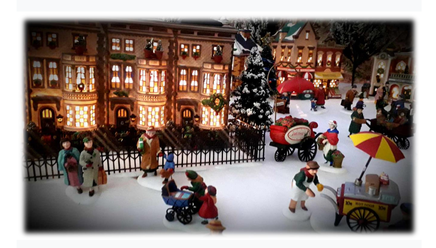
Christmas Village 2023 By Peppe Apuleo

5 days of work were spent on the construction of this village for a total of 160 hours divided between 2 people. It extends over a single floor with a backdrop of mountains created in polystyrene and a sky illuminated with LEDs. Below are some photographic details.