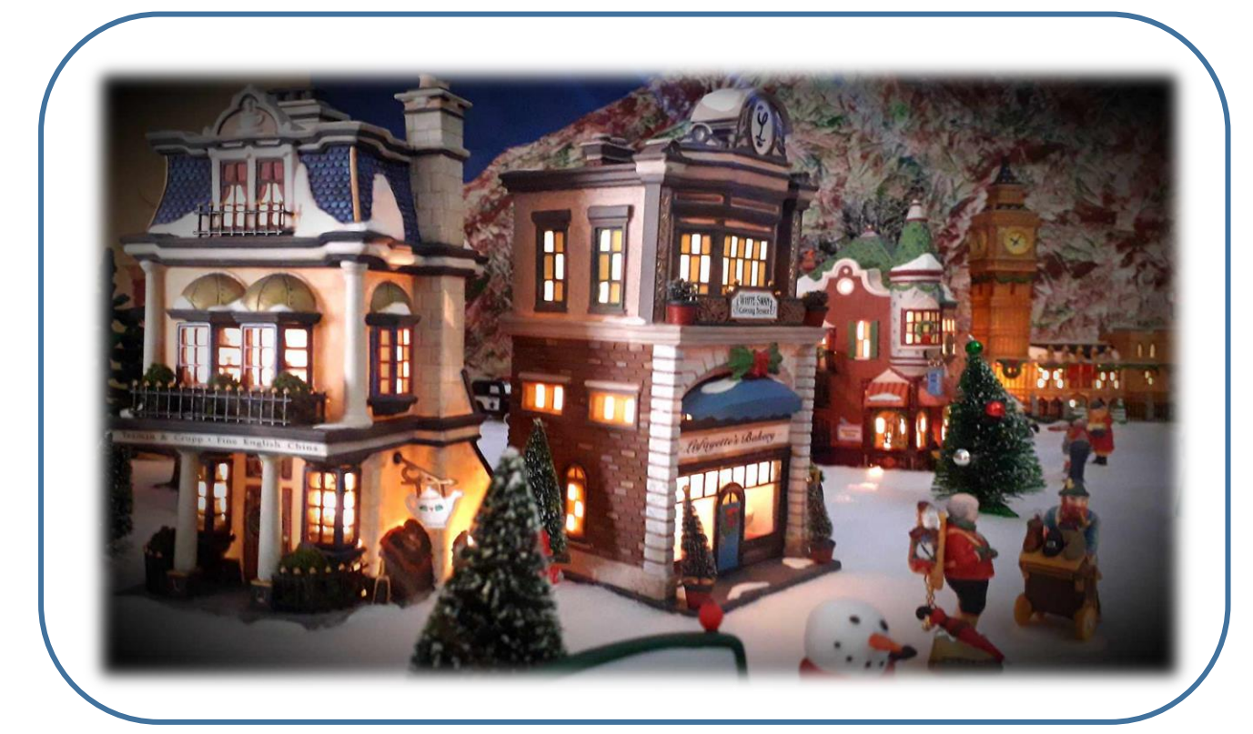
Christmas Village 2023 By Peppe Apuleo