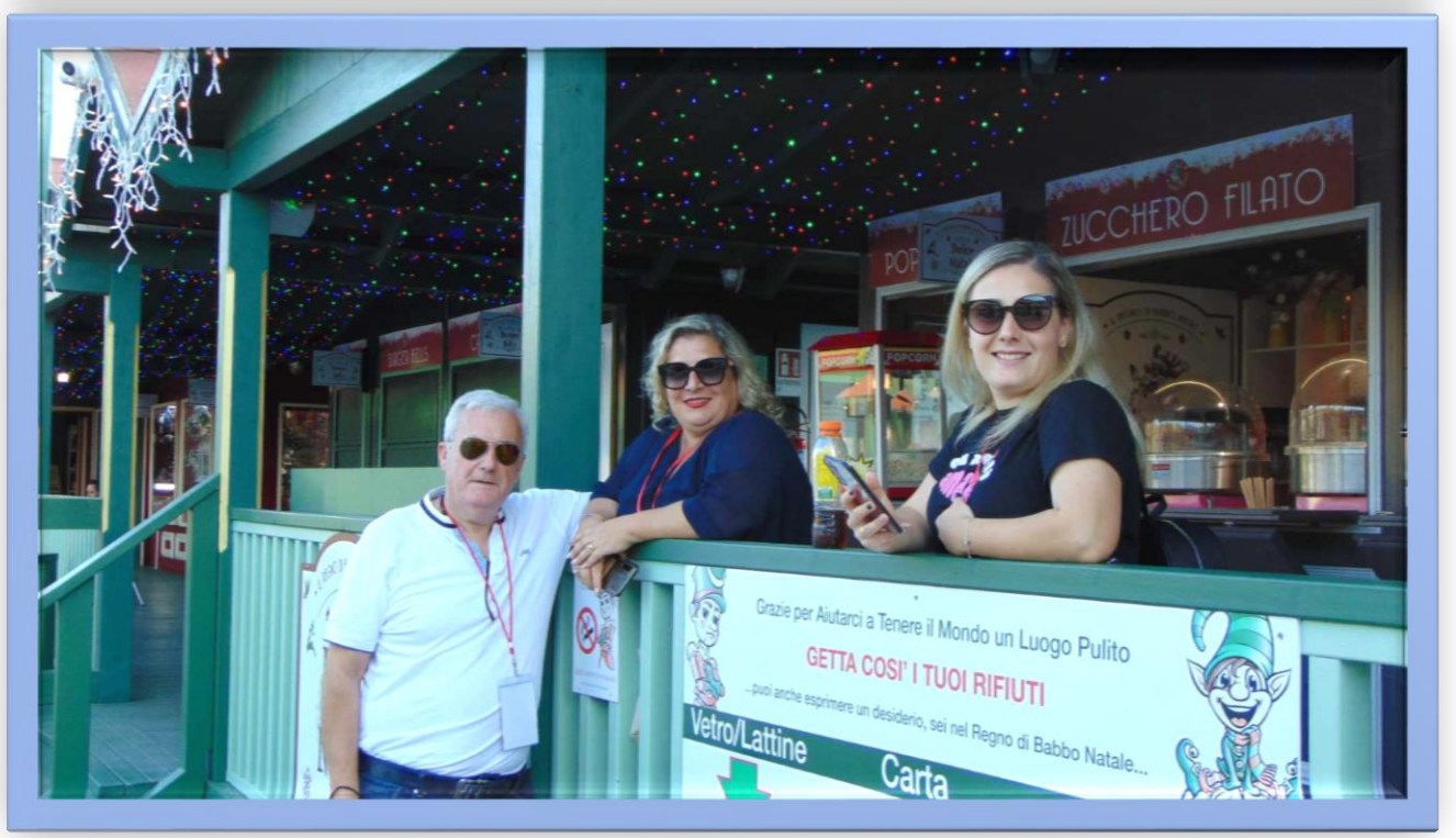
by Peppe Apuleo Lemax Passion Christmas Village